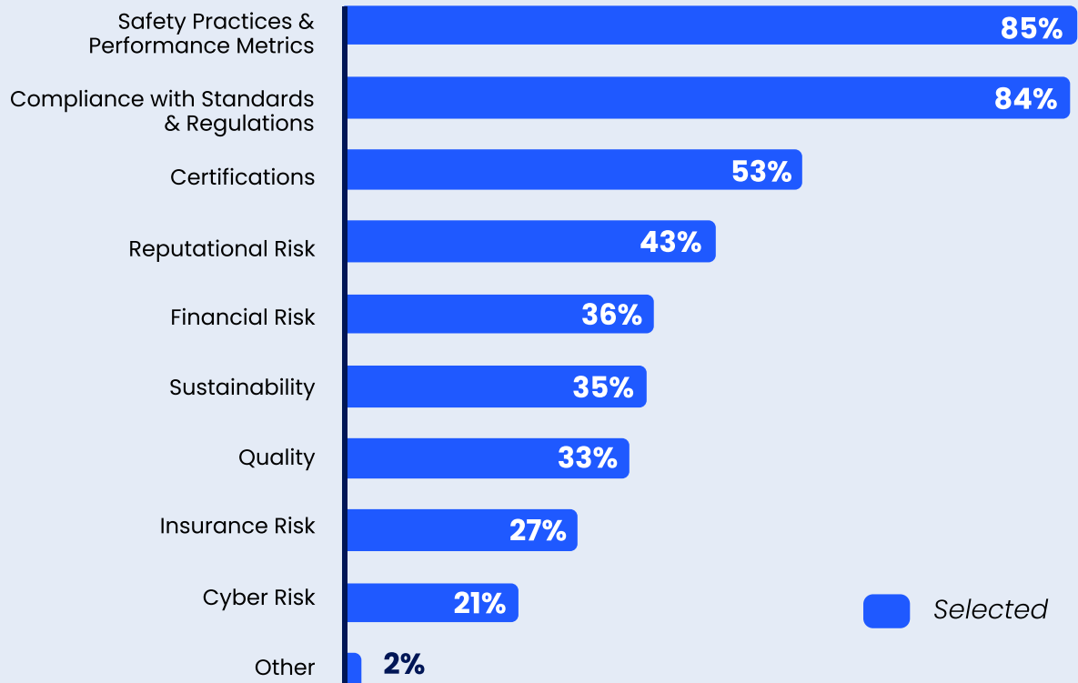
N=100 Note: Data labels are rounded to zero decimal places; percentages less than 6% are written as numbers.

When surveyed on how supplier performance is rated, cyber risk was one of the lowest selected across all categories. When compared across the industries. It is becoming increasingly vital, to overall operations to close this gap, with some sources with some sources stating that approximately 75% of software breaches occur via supply chain IT software suites. Recent events, such as the 2023 Bank of America breach, highlight how cyber-attacks can impact physical operations beyond just data breaches and regulatory fines.